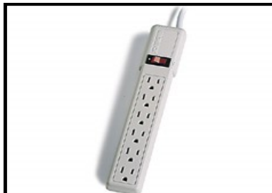
Put the power bar on your computer desk to avoid having to bend down