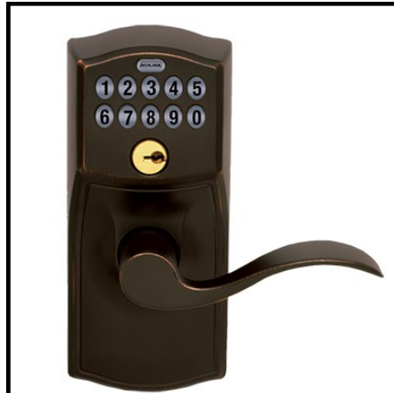
Enter a code instead of using a key to unlock/lock doors