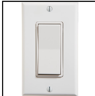
Flat light switches are easier to use. Lower light switches to a comfortable height.