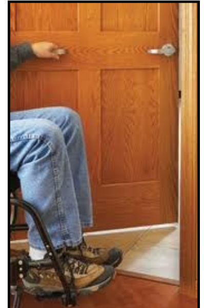
Install handle near door hinge to make it easier to pull close