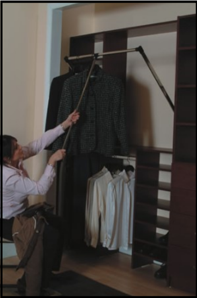
Pull down closet rods