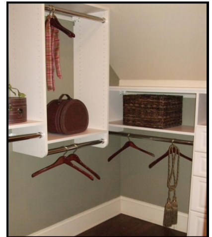
Install rods lower for easy access. Now the kids don't have an excuse to not hang their jackets!