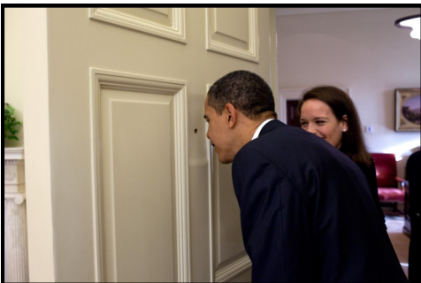
Have door peep holes at different heights