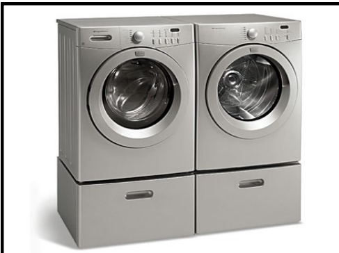
Front loading washer & dryer