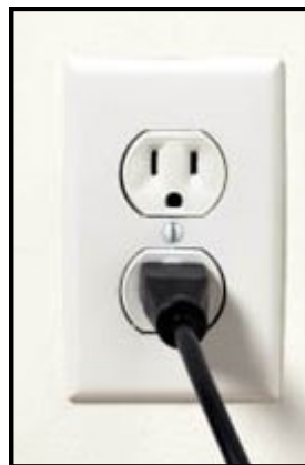
Raise electrical outlet to about knee height