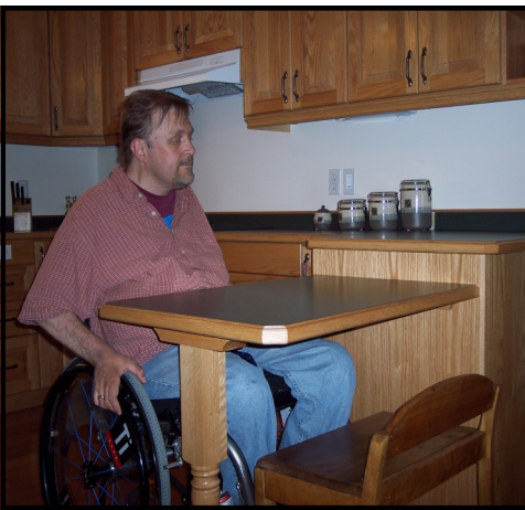
Installing a lower height work counter