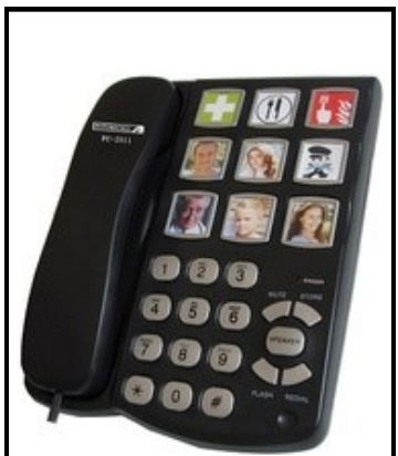
Big button phone with pictures