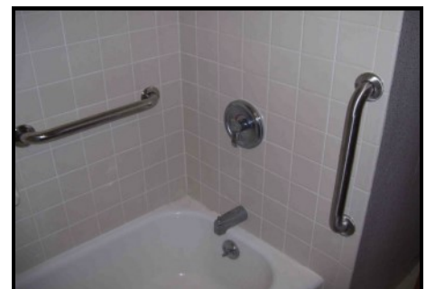
Bathroom Grab Bars