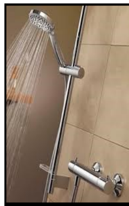
Height Adjustable Shower Head