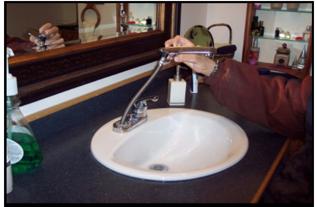
Hand Held Faucet