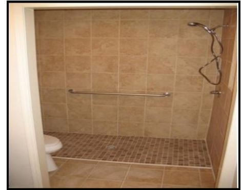
Roll In Shower with No Threshold