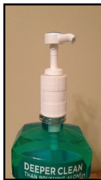
Pump for Easier Use