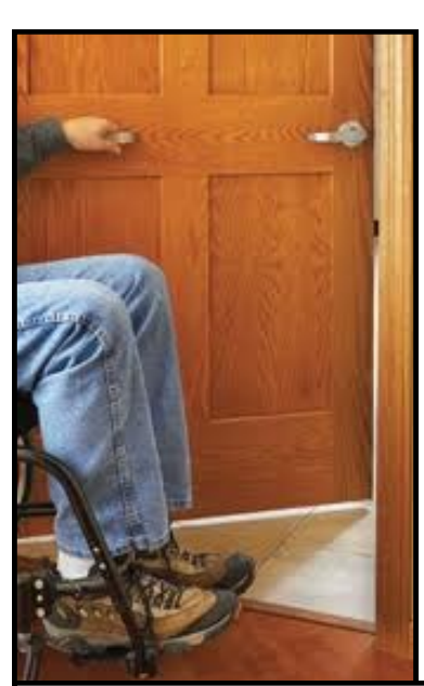
Install handle near door hinge to make it easier to pull close