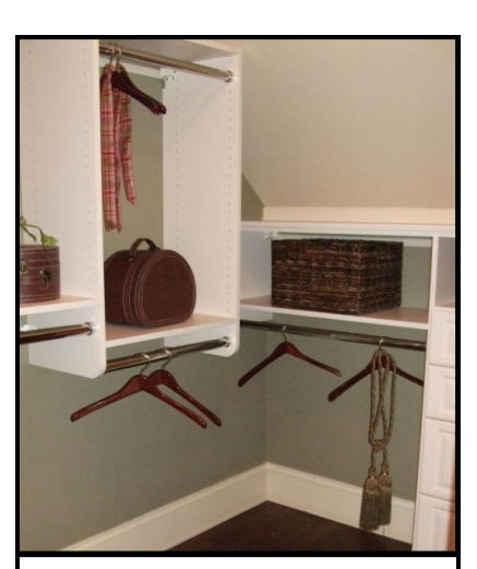
Install rods lower for easy access. Now the kids don't have an excuse to not hang their jackets!