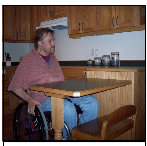
Installing a lower height work counter