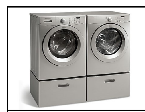
Front loading washer & dryer