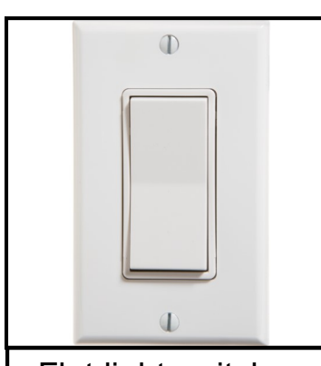
Flat light switches are easier to use. Lower light switches to a comfortable height.