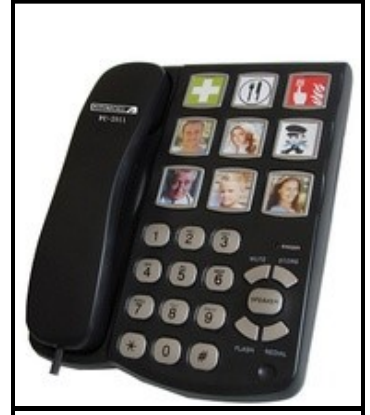
Big button phone with pictures