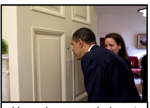
Have door peep holes at different heights