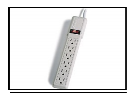
Put the power bar on your computer desk to avoid having to bend down