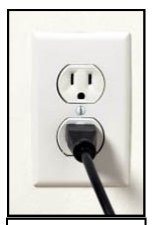
Raise electrical outlet to about knee height